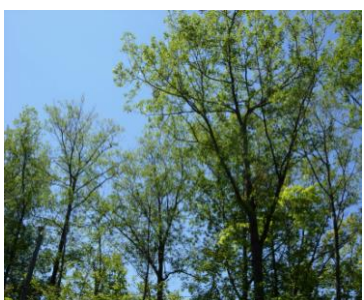
Damage on oak trees in July