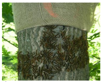
Caterpillars under the burlap