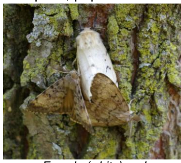
Female (white) and male (brown) moths

Caterpillars hatch from overwintering eggs in mid-spring. They feed on tree leaves at night for about 7 weeks. In mid-summer the caterpillars pupate in sheltered areas. Adult moths emerge about two weeks later in early August. Soon after mating, females lay oval shaped egg masses on tree limbs, rocks, buildings, vehicles, and other sheltered areas.