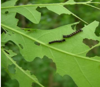
Damage from young caterpillar

Young caterpillars chew small holes on the upper surface of leaves. Older larvae may eat entire leaves, except the major veins. Caterpillars disperse on silk threads to be carried by the wind to other trees. Most deciduous trees can withstand only one or two consecutive years of defoliation. Repeated leaf loss stresses trees and can lead to their death. During outbreaks the caterpillars are an extreme nuisance; trees lose their foliage, caterpillars crawl everywhere, and their droppings rain from trees.