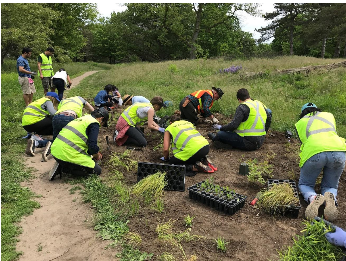
Spring Planting 2019 in Tablelands